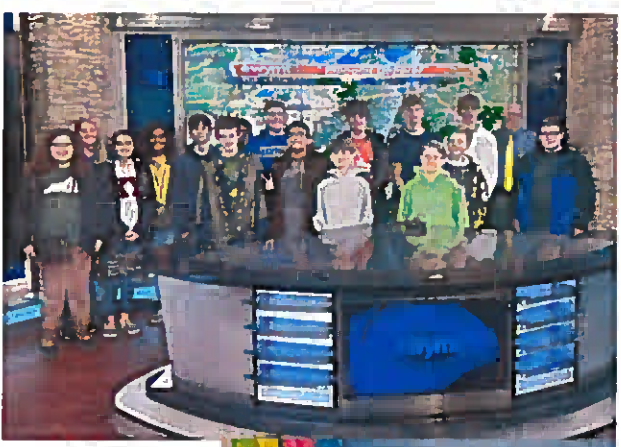
Students from James A Cawood Elementary toured WYMT. They also participated in a living wax museum of presidents and first ladies, which they completed as a project and presented to the whole school to tour. They also performed Seuss stories for Dr. Seuss Day.